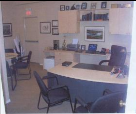
Private Office - Main Level