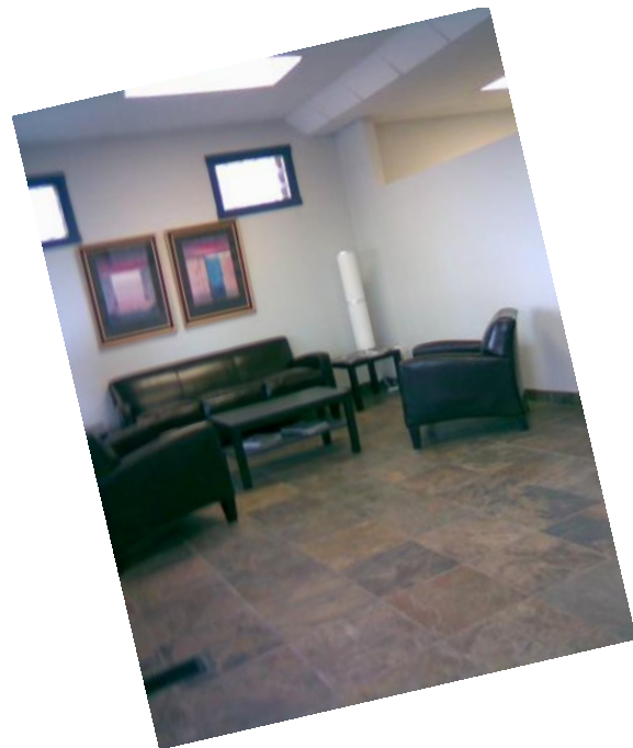
Main Floor Reception

This package is intended for information purposes only. Recipients should not rely upon it for factual information. The information contained within this package is considered to be accurate but Calgary SMI Commercial Real Estate Limited does not warrant it to be so. Recipients should conduct their own investigations to determine the accuracy of information contained herein, including confirmation of land use. All information is subject to change without notice.