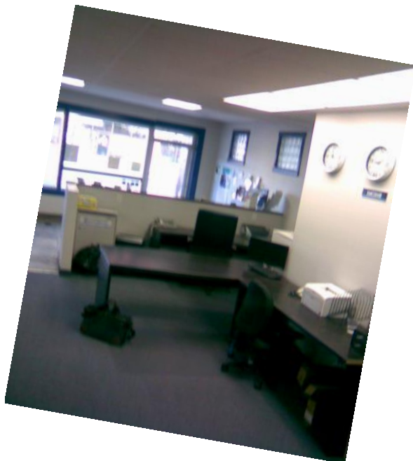
Main Floor Work