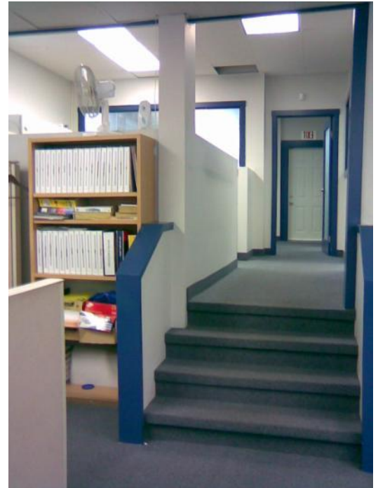
Main Floor Rear